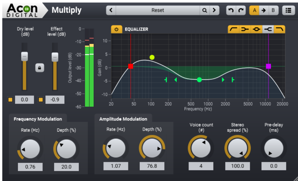
The graphical user interface of the Multiply plug-in in action.

The graphical user interface of Acon Digital Multiply is designed to give quick and intuitive access to all the parameter settings defining the sonic quality of the effect.